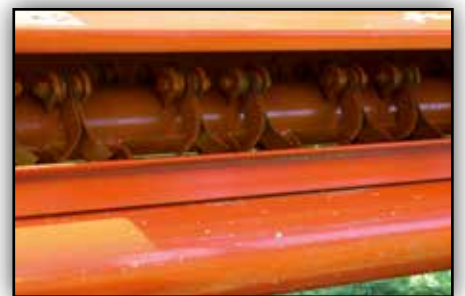
Rotor accurately balanced for smooth running