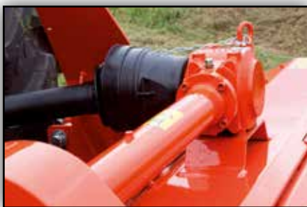
Gearbox with integrated free wheel