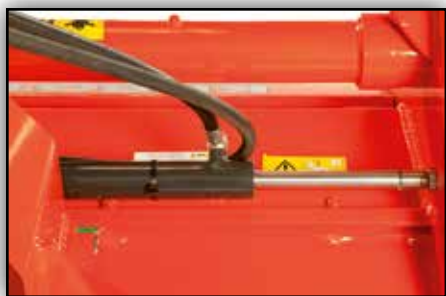
Easy adjustment by hydraulic cylinder (option)