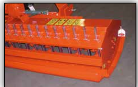
The Kubota SE3000 series can be equipped with rake tines to improve chopping on prunings.