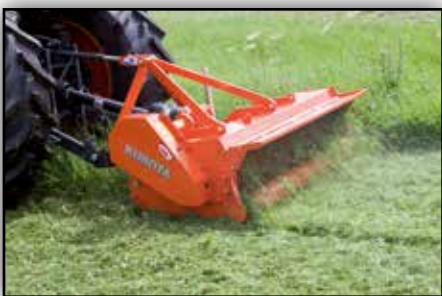
Rear roller as standard