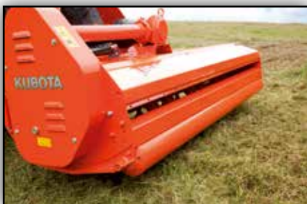
The rear roller is standard equipment, its diameter is 160mm.