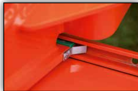
Special nylon plate fitted into sliding guide rail ensures smooth movements without the need for lubrication or maintenance.