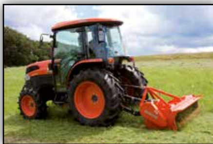
Adjustable lower hitch