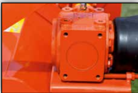
Gearbox with integrated free wheel

The core of the SE1000 series is the rotor: high rotation speed (1993rpm) in combination with a huge number of working tools make the SE1000 series a unique chopper.