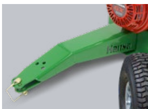
Tow Bar w. pin