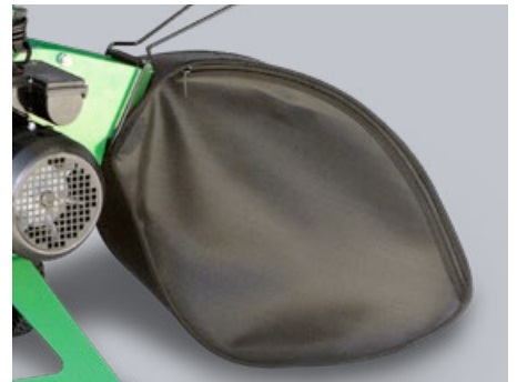
C3e / C4 bag