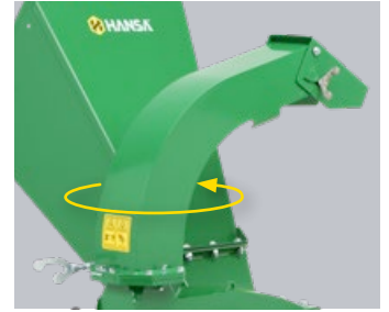
Swivel outlet (for C13, C13RT & C13PTO)