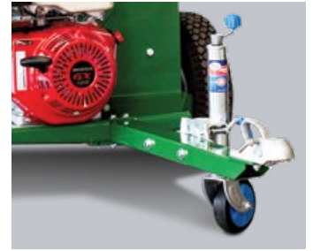
Tow bar (non-road tow)